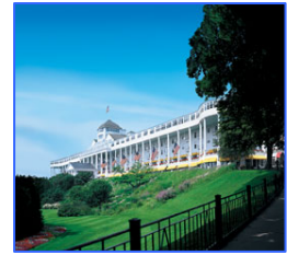
The Grand Hotel

$850.00* per person double occupancy $1045.00* single occupancy $50.00 deposit due upon making reservation