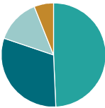
Allocation of underlying funds*